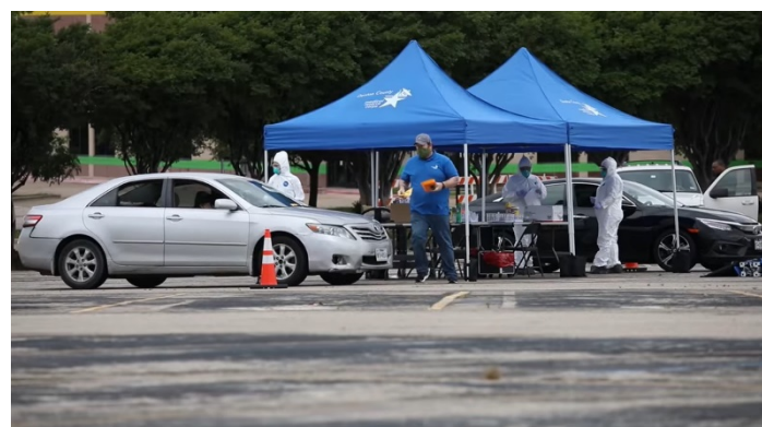
Pictured: Denton County MRC (TX)