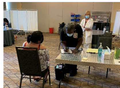
Alamo Area MRC (TX)