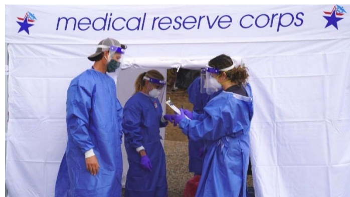
Pictured: Southwest Colorado MRC (CO)