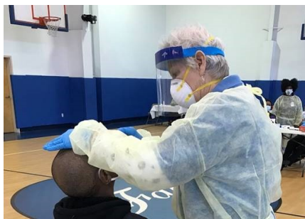
Norfolk MRC (VA)