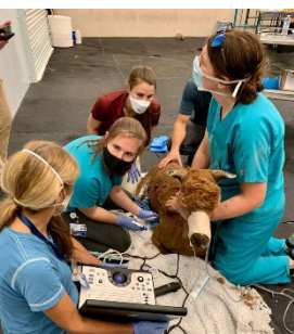
UC Davis VERT MRC (CA)

Note: MRC network COVID-19 response efforts are ongoing. Activities and data points noted in this document only include MRC efforts completed during federal fiscal year 2020 (October 1, 2019 – September 30, 2020). Activities that began during the fiscal year, but continued beyond September 30, 2020, are not accounted for in this document. In addition, some states have seen significant growth in volunteer numbers this past year; this document may not reflect the most current numbers.